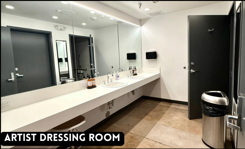
ARTIST DRESSING ROOM