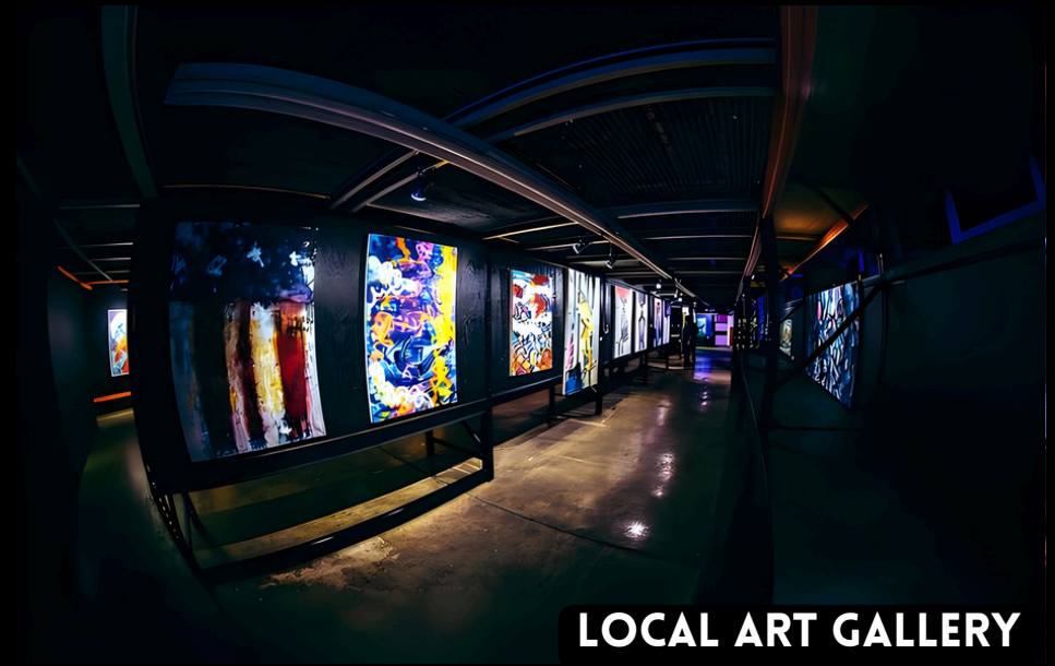
LOCAL ART GALLERY